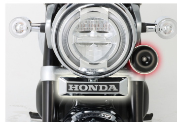
Emblem added, and horn relocated to left side of headlight.